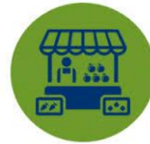
Farmer's Markets and Fresh Food Options