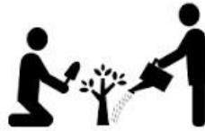
Community and School Garden Program